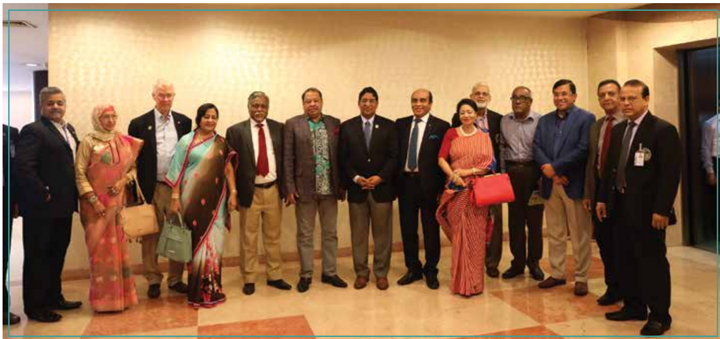
Sir Richard John Roberts, Nobel Prize winner (1993) in Physiology or Medicine, with Dr. Mohammad Abdur Razzaque, MP, Honorable Minister, Ministry of Agriculture, BOT Members, and other distinguished guests.

Sir Richard John Roberts is an English biochemist and molecular biologist who was awarded the 1993 Nobel Prize in Physiology or Medicine with Phillip Allen Sharp for the discovery of introns in eukaryotic DNA and the mechanism of gene-splicing. He is a GMO activist, and he visited NSU in October 2019 for a regional seminar on GMO Products. NSU News had the opportunity to have an exclusive interview with Sir Richard.