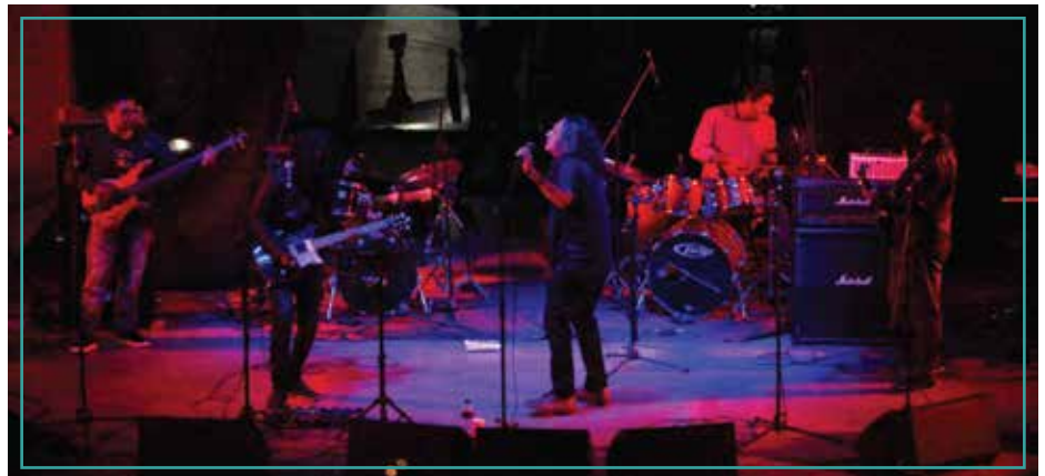
A musical performance during Dhrupod 4 .