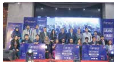
20 Youths Learn to Solve Critical HR Problems