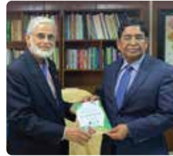
14 NSU Presents Agribusiness Innovation Recommendations