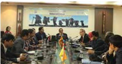
9 Accountability and Justice in the Rohingya Crisis