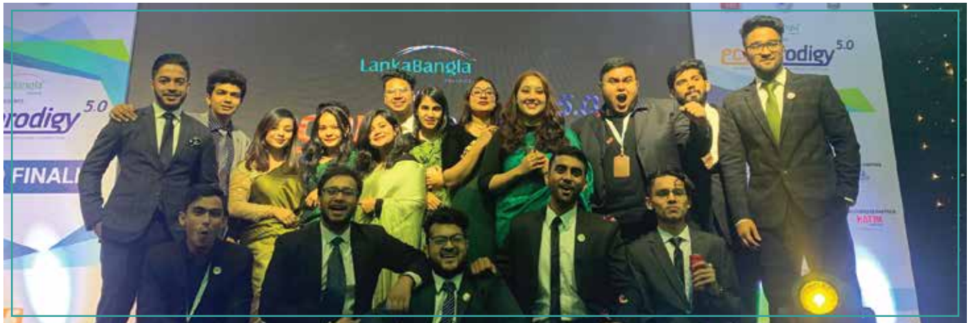
The champion team from North South University posing for the photograph.

EconProdigy is the largest inter-university policymaking competition in Bangladesh; the first of its kind in the country. It was prudently constructed by North South University's Young Economists' Forum (YEF), an academic student club, to encourage and facilitate the student body of the country in actively participating in dialogues revolving around real economic issues. While it started with a different structure and name, the competition was rebranded as