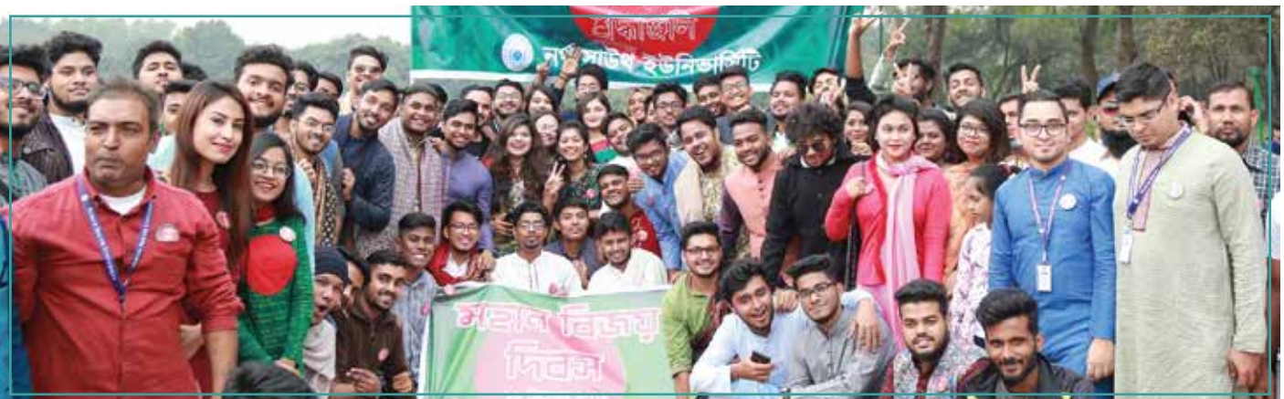
Students, faculty members, and other members of the NSU family pay homage to the martyrs at the National Memorial, Savar.