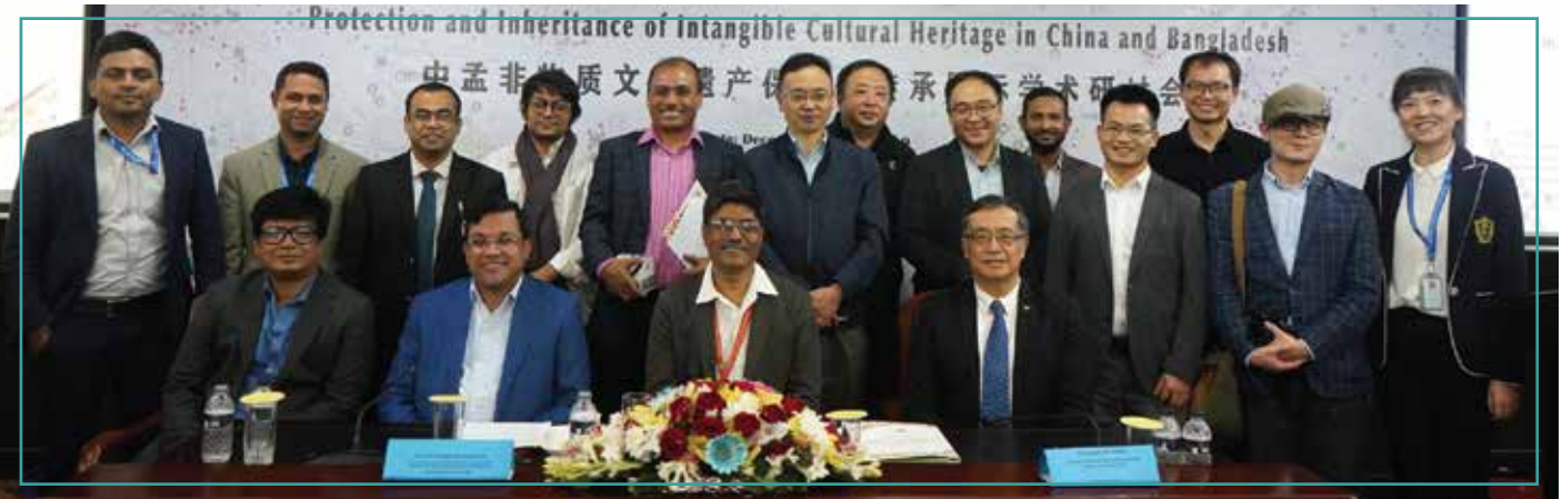
Distinguished guests at the Joint Seminar on Protecting Cultural Heritage in China and Bangladesh.