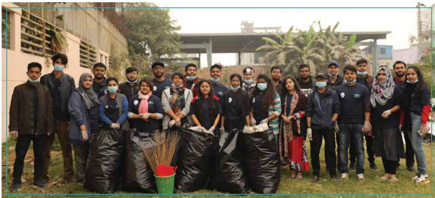
Members of North South University Earth Club take the Trash Tag Challenge 2019.

This event was one of the Club's many steps towards better living, and they have a lot more to come. ■