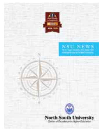
NSU News Cover December 2019-January 2020