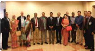
7 A Tête-à-tête with Sir Richard John Roberts