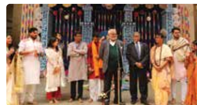
24 Saraswati Puja 2020 Highlights