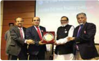
5 North South University Observes the 49 th Victory Day