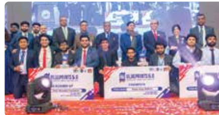
18 Financial Case Competition Goes International