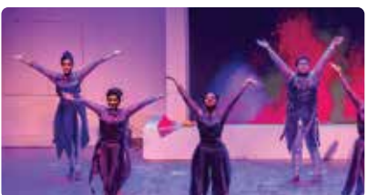
12 23 rd ACE Highlights